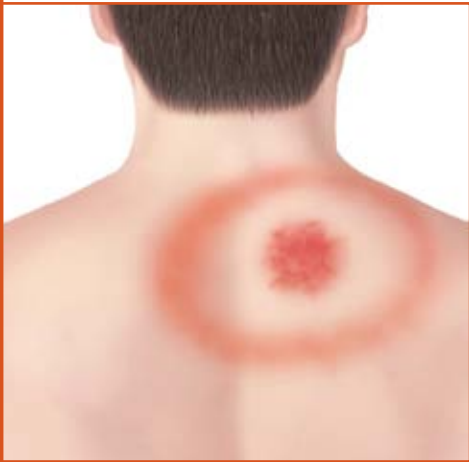
Bull's eye rash on the back.